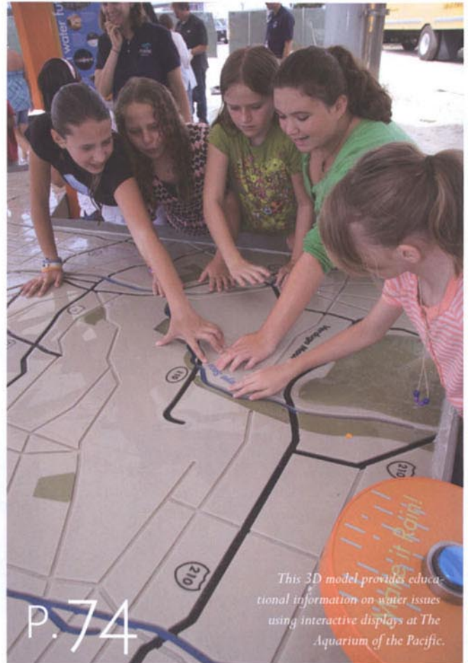
This 3D model provides educational information on water issues using interactive displays at The Aquarium of the Pacific.