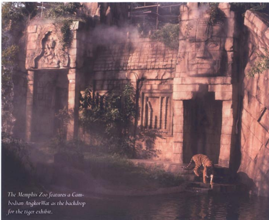
The Memphis Zoo features a Cambodian Angkor Wat as the backdrop for the tiger exhibit.